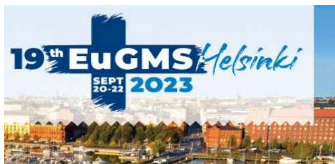
Figure 2 - WG participation in 19th EuGMS 2023

Organisation of a Joint Session with the European Geriatric Medicine Society (EuGMS) during the 19th Annual EuGMS Congress in Helsinki (September 20-22, 2023) on the “Criteria for considering the reduction of antihypertensive treatment in older adults.